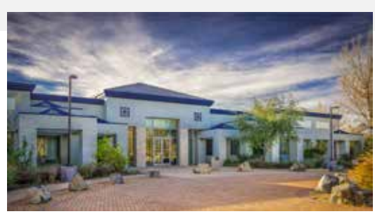
- Administrative Headquarters

Located in the city of Chino, IEUA is the first public agency in the nation to receive the Platinum rating from the U.S. Green Building Council's Leadership in Energy and Environmental Design (LEED™). Finalized in 2003, IEUA's administrative headquarters takes water and energy conservation to new levels. The extensive use of recycled materials is seen throughout the interior and exterior of the headquarters complex.