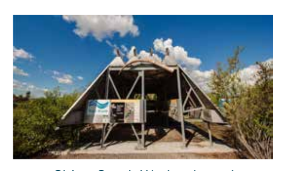
Chino Creek Wetlands and Educational Park (CCP)

Located in the city of Chino, the Chino Creek Wetlands and Educational Park (CCP) provides a hands-on opportunity for the community to experience the importance of constructed wetlands in the protection of our watershed. CCP helps improve water quality, flood control, habitat restoration, water conservation, and provides recreational opportunities for the public. CCP highlights the history of the Chino Valley and the importance of water in our region's economic development with stylized graphs of the hydrologic water cycle, the importance of saving water and public education on how to use water wisely.